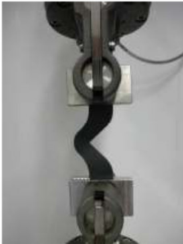
Fig. 1: Test Status