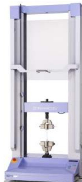
AGS-X Table-Top Precision Universal Tester