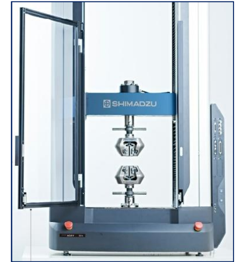
AGX-VD 50kN Desktop Modell

AGX-V, versatile and robust high-end universal testing machines. Desktop and stand models in a new design. Even faster, safer and with even more interfaces.