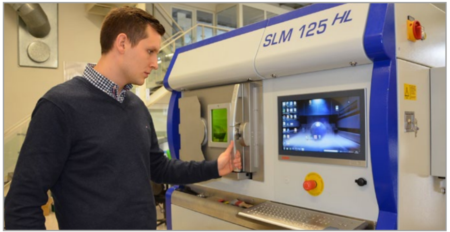
> Lightweight components for sectors such as air and space travel can be made using the principle of laser beam melting.

laser beam once again outlines the contour of the component. The process continues until all the layers have been generated and the finished component can be removed. All process data required by the equipment to produce the component, such as 3D CAD data, is collected in advance. Components produced in this way are being used more and more in key industries, such as air and space travel and the automotive industry. For example, certain engine manufacturers are batch-producing and installing engine parts made using additive manufacturing.