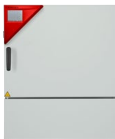
> KMF 115 model

Further models are available here > go2binder.com/en-KMF