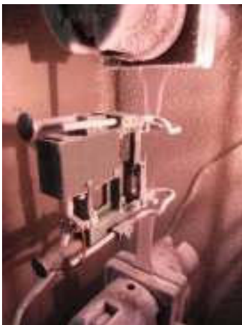
Fig. 1: Test Status