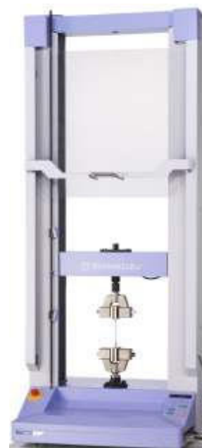
AGS-X Table-Top Precision Universal Tester